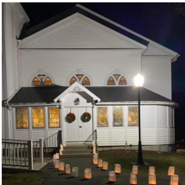
The church entrance was glowing.