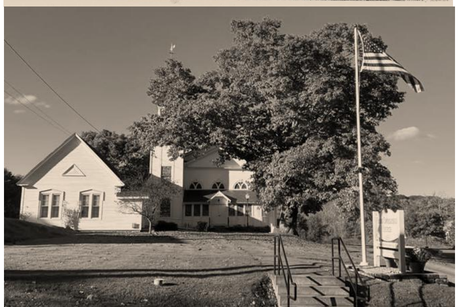
Called to Service by Grace Empowered by Love