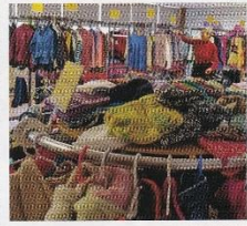
Children's Clothing Exchange