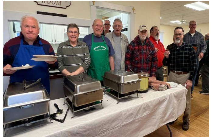
The annual Men's group Easter breakfast was delicious, better than ever. The smell of bacon permeated throughout the church. Nearly 40 were in attendance. Thanks guys!